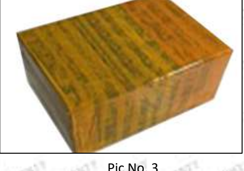
Pic No. 3 International express packaging: Wrapped with yellow tape after wrapping black protective film